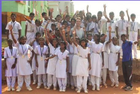
PSD coaches pose with the children at BBVM